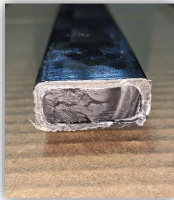
Figure 1: Fractured tip.

Thanks to your valuable feedback, we have discovered some unusual tip fractures. Working closely with our manufacturer, we have identified a potential issue with a batch of tips. Reportedly this batch may be susceptible to low temperature brittle fracture as in Figure 1. The extreme cold surfaces found in older rinks may also increase this risk.